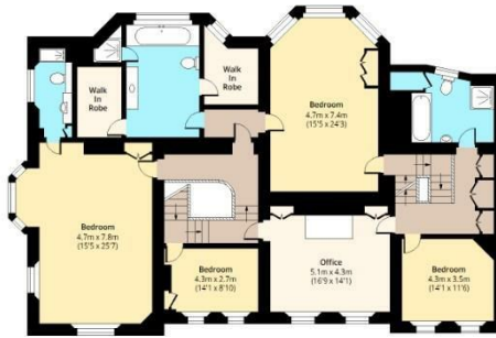
First Floor Approx. 225.38 Sq. meters (846 Sq. feet)